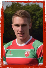
Steve Pilkington Centre